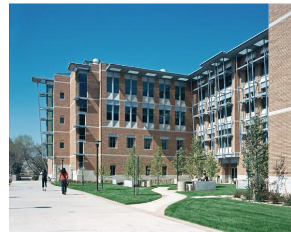
Chemical Sciences Building

Many Chemistry majors are engaged in research, some as early as their freshman year. These students work side by side with faculty, postdoctoral researchers, and graduate students on exciting projects at the cutting edge of modern chemistry. UCR's Undergraduate Chemistry Club meets regularly for social activities, field trips, networking, and outreach.